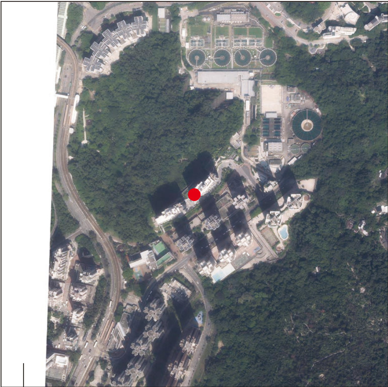
This blank area falls outside the coverage of the relevant aerial photograph 有關鳥瞰照片並不覆蓋本空白範圍

Adopted from part of the aerial photograph taken by the Survey and Mapping Office of the Lands Department at a flying height of 6,900 feet, photo No. E230524C, date of flight: 10 October 2024. 摘錄自地政總署測繪處在6,900呎的飛行高度拍攝之鳥瞰照片，照片編號為E230524C，飛行日期：2024年10月10日。